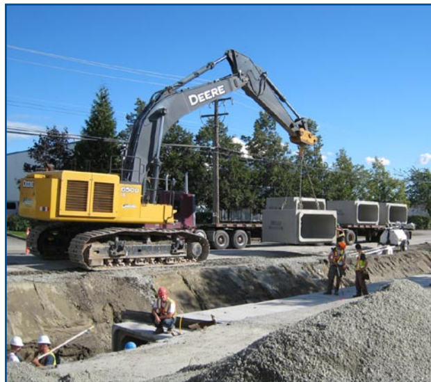
Sections of box culvert are lifted off the truck on Broadway Street near the City Operations Centre.

Drivers are advised to expect delays through the construction zone, and to take alternate routes when possible. For more information, visit www.portcoquitlam.ca/broadway or contact Dave Currie at 604.927.5205.