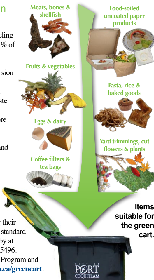
Items suitable for the green cart.

For more information about the Kitchen Scraps Collection Program and other waste-reduction information, visit www.portcoquitlam.ca/greencart .