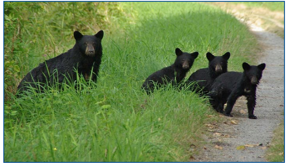
Bears will return repeatedly to places where food is easy to find (such as from a garbage cart or back yard) – and teach their cubs to do the same.