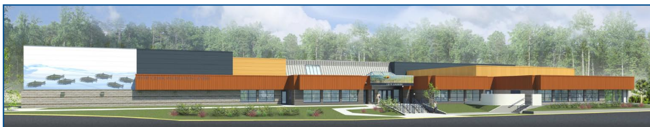
Artist rendering of new Hyde Creek Recreation Centre exterior.

The project's budget is $3 million, including a $900,000