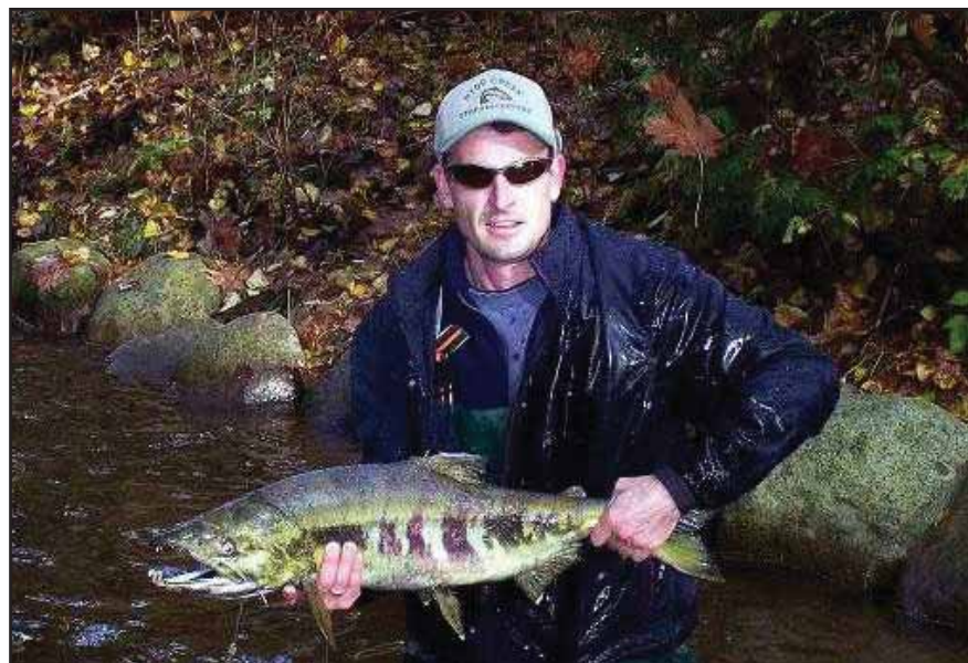
This year's Hyde Creek Salmon Festival takes place Sunday, Nov. 12.