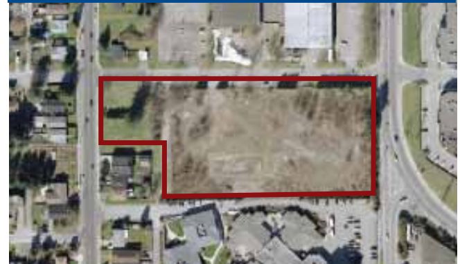
2170 Kelly Ave & 2380-90 Mary Hill Rd