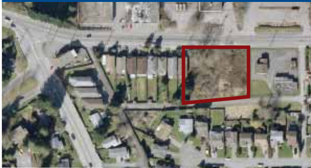
1932-56 McLean Avenue