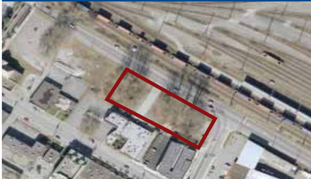
2230-52 Kingsway Avenue