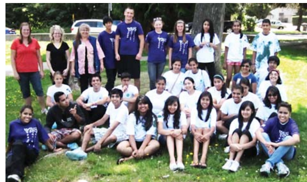
Participants in the Aug. 13 graffiti paint-out.

Armed with paint cans and brushes, groups of Port Coquitlam teenagers took to the streets this summer to leave their mark on walls, portables and other surfaces. But they