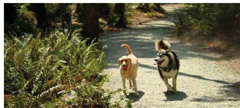
Dogs can run free at the Shaughnessy Park Dog Off-Leash Area.

Adoptable unclaimed pets receive medical care, vaccinations, an identifying tattoo or microchip, and are spayed or neutered before being placed for adoption by the City's animal control contractor Countryside