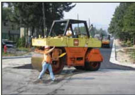
Hawthorne Avenue construction