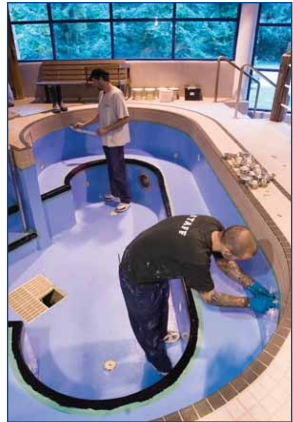
Upgrades during the recent maintenance closure at Hyde Creek Recreation Centre included new paint in the hot tub.

The Robert Hope playground is designed for children ages 2-5, while the Gates Park playground is for children ages 6-12.