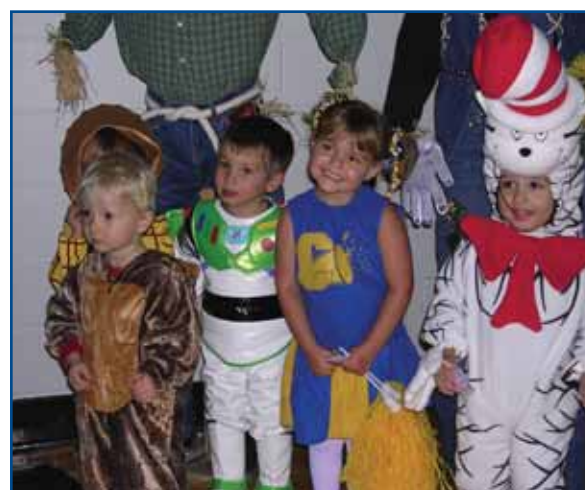
The Halloween Howl on October 27 is one of several fun family events happening this fall in Port Coquitlam.