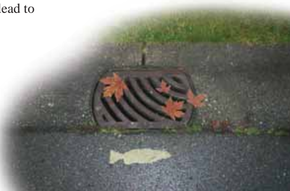
Leaves can clog catch basins and cause flooding.

Please report any damaged catch basins to the Operations Division by calling 604-927-5488 or 604-927-5480.