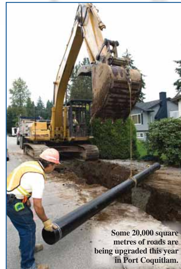
Some 20,000 square metres of roads are being upgraded this year in Port Coquitlam.

Cities in Metro Vancouver will be subject to new waste disposal rules on January 1, 2008, including a ban on throwing recyclable or returnable items into the garbage. Part of the regional Zero Waste Challenge, the rules aim to encourage more recycling and reduce waste going to landfills. For details, visit www.gvrd.bc.ca/zerowaste .