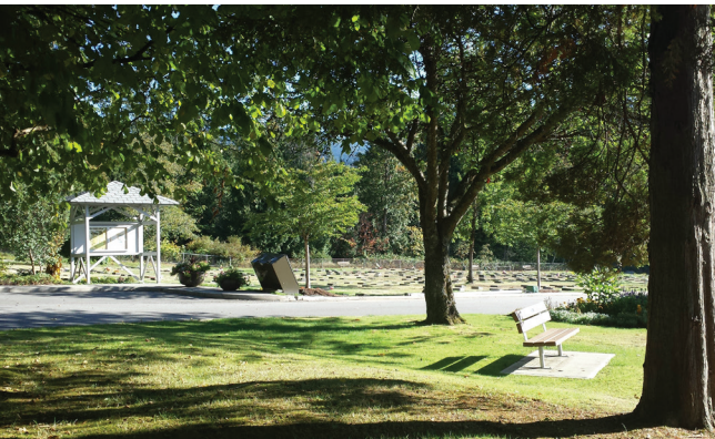
A quiet place to reflect. Memorial benches available.

To select an appropriate cemetery plot, call our Cemetery Services staff at 604.927.5251.