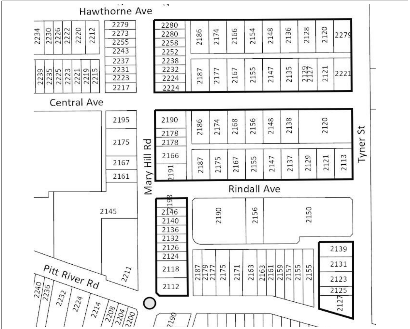
Areas outlined to be re-designated as Rowhouse

The Council meeting is open to the public and anyone wishing to attend may do so in person by attending Council Chambers. The meeting will also be broadcast live on the City's website and can be viewed by going to portcoquitlam.ca/council .