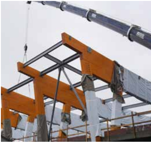
New Community Centre