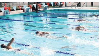
Facility upgrades and reopening of Centennial Pool