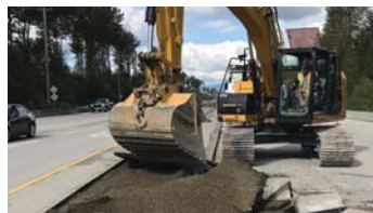
Road rehabilitation and other key infrastructure investments