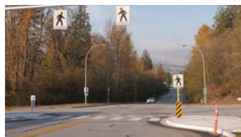
Pedestrian safety, cycling and traffic calming projects