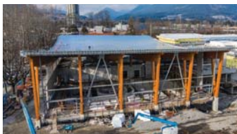
Construction of Port Coquitlam Community Centre