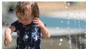
Park upgrades including Castle Park spray park and Fox Park playground