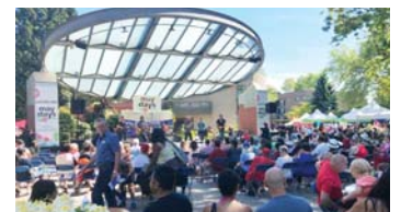
Support for more and enhanced community events