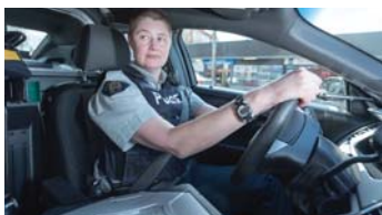
A share of six new RCMP officers focusing on emerging issues